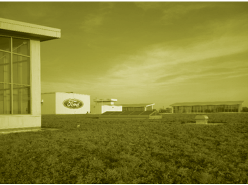
Above, top: The Ford Dearborn Truck Assembly Plant in Dearborn Michigan has a 10-acre green roof that is a 2004 Green Roof Awards of Excellence Winner.