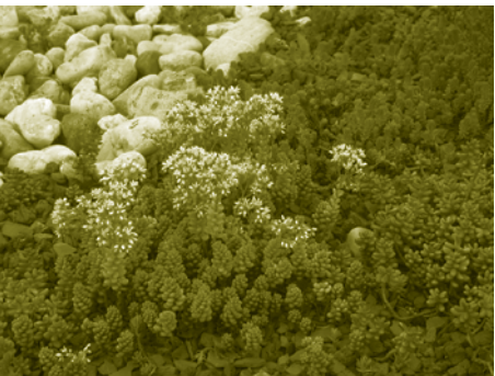
Above, middle: A photo of the green roof at the Bruker Deltronics Headquarters in Billerica, MA. Photo: © 2005, Roofscapes, Inc. Used by permission; all rights reserved.