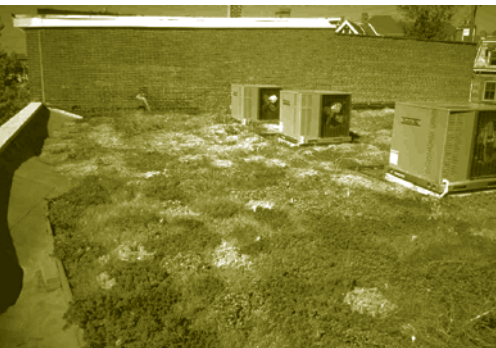
Above, bottom: The Fencing Academy of Philadelphia was retrofit with a 3.5"-thick green roof, installed over the existing roof structure.