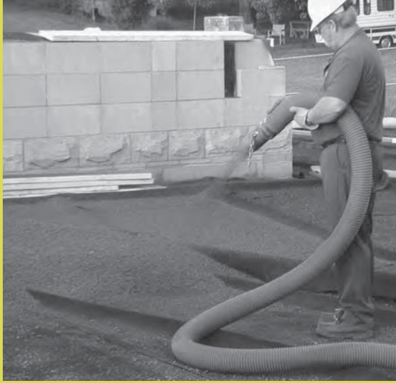
Above: Installation of eight inches of soil medium using pneumatic equipment at the Oaklyn Branch Library in Evansville, IN.